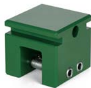
Sno Cube™ Mini