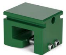
Sno Cube™ Wide