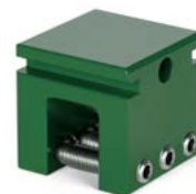
Sno Cube™ HD

All Sno Cubes™ also available in HD (Heavy Duty) with 5 set screws for heavy snow load applications.