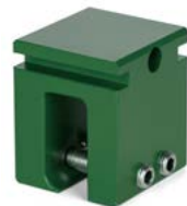
Sno Cube™ KLOC