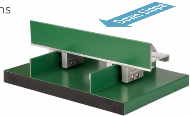
Typical 2" iClad™ Assembly