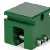
Sno Cube™ KLOC Mini